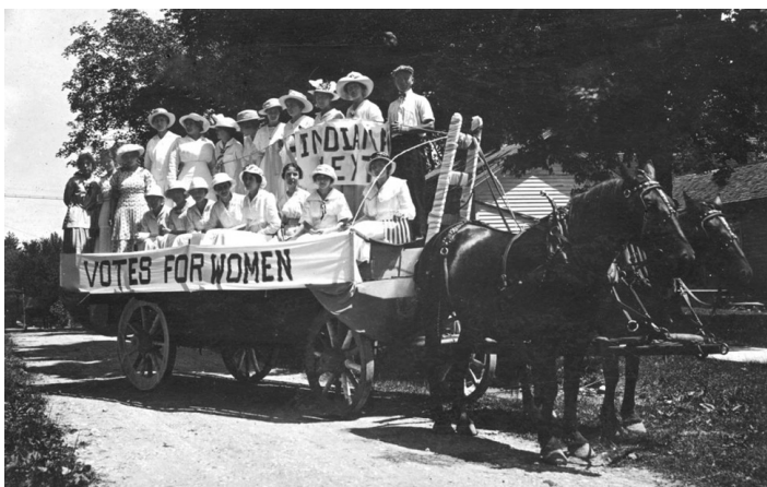
Circa 1910s. Women gained the right to vote when the 19th Amendment was ratified on August 18, 1920. Suffragist activists marched and lobbied for years before this was accomplished. This photo shows suffragists in Auburn, Indiana.