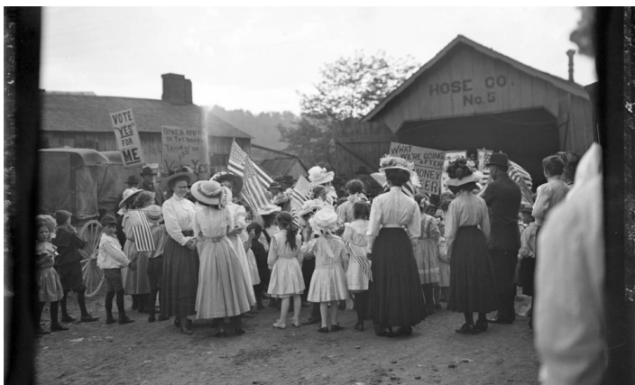
Circa 1900s. The women are possibly campaigning for the right to vote in Brookville, Indiana.